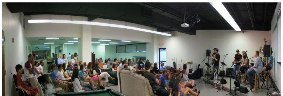
Advent's youth are now using their new room for Huddle...and they all fit and have room to bring friends too!