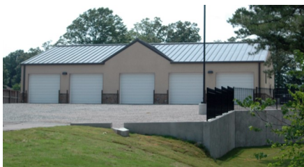
Dave's Barn at Advent Cordova

We are setting aside one-tenth of each dollar collected as a tithe toward local mission. A team has been meeting this year to consider how we might best use these funds and the skills and passions of our members to reach out and serve our community. By year's end, we will announce some exciting new initiatives that will do just that!